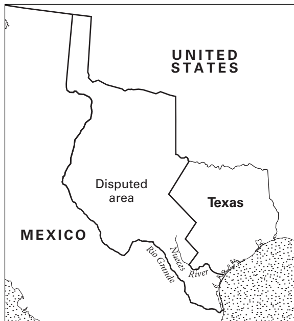
Disputed Texas, 1846